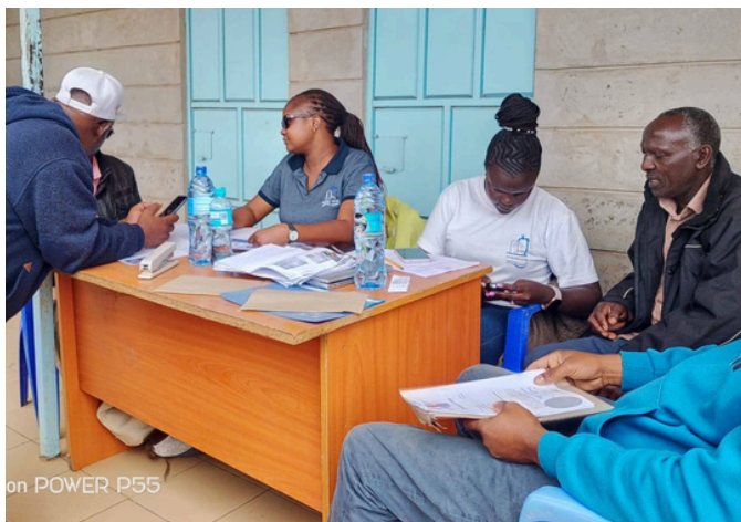
Kasarani region customer care staff take residents through the water and sewer application process.

The lack of proper infrastructure has led to environmental and health concerns, which the new project aims to alleviate.