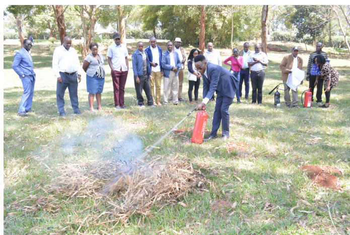
[File Photo] Training of Fire Marshalls at Kabete Treatment Works

a)An employee is not entitled to compensation if an accident is caused by the deliberate and willful misconduct of the employee (unless he/she dies or sustains permanent disablement of forty percent or more).