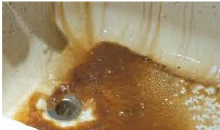
Contaminated water in Earlewood, Colombia USA

As efforts to contain the fires continue, the residents are struggling to access potable water. This follows several advisories issued by public health officials to the residents of the affected areas warning them not to drink the water until further notice.