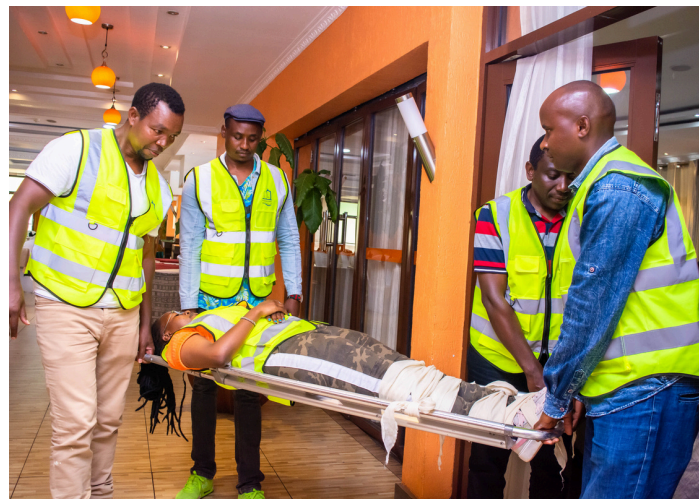
[File Photo] OSH training

c)An employee being conveyed to or from his/her place of employment by means of a vehicle provided by the employer is deemed to be in the course of the employee's employment.