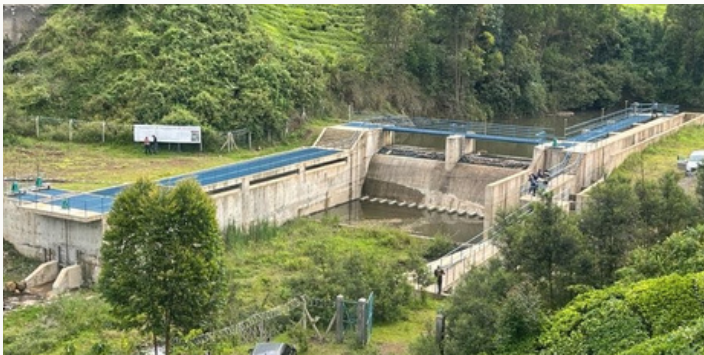
File Photo: Maragua Intake